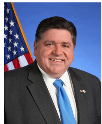
Governor JB Pritzker

A stylized handwritten signature in black ink, appearing to read "JB Pritzker".