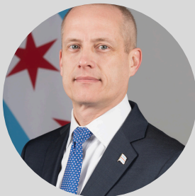
Moderator Bruce Coffing , CISO, City of Chicago